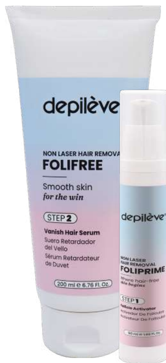
HAIR STOP SERUM